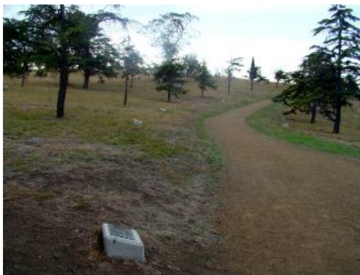
Soldiers Walk, Hobart