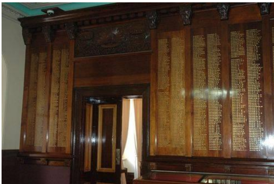
Hobart Roll of Honour